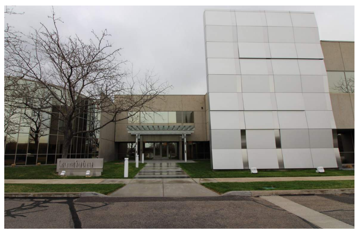
Shuttle Stop 13 is in front of building number 1 and will stop at the entrance. (Pictured Above)