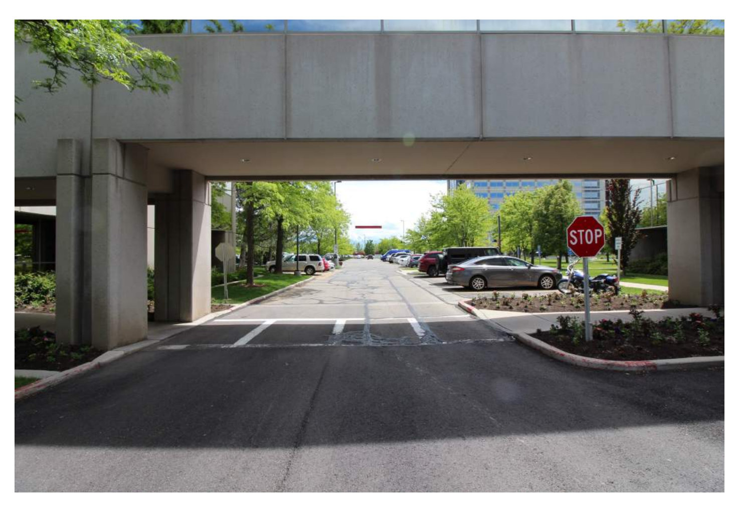
Shuttle Stop 4 is at the breezeway overpass between buildings 4 and 5 (Pictured Above)