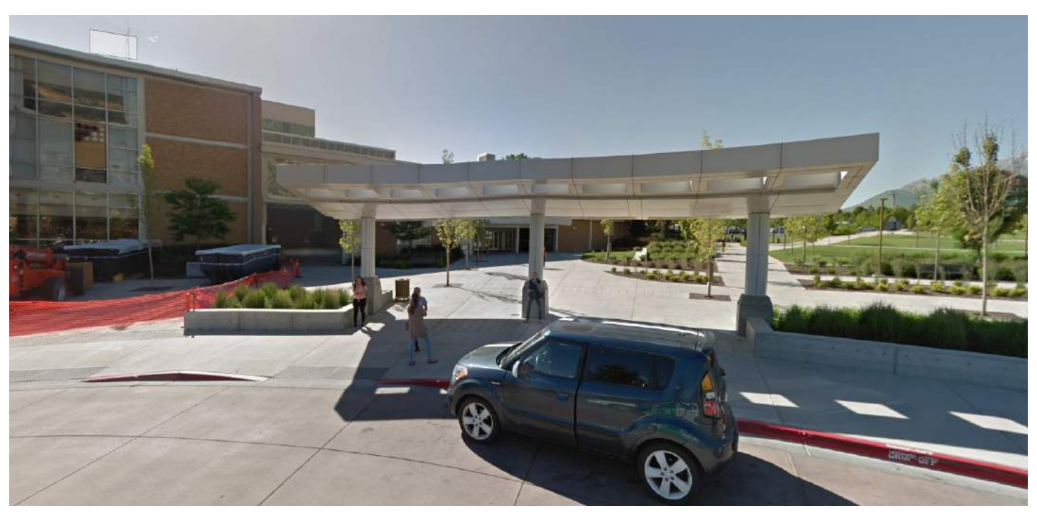
Shuttle Stop 8 will be at the traffic circle infront of the BYU Wilkinson Student Center at the . (Pictured Above)