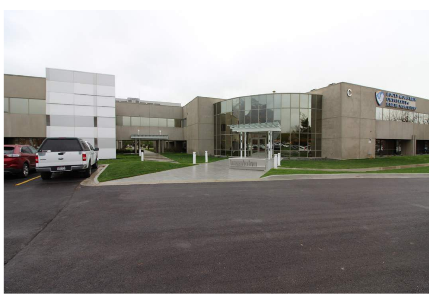
Shuttle Stop 14 is in front of building number 3 and will stop at the entrance. (Pictured Above)